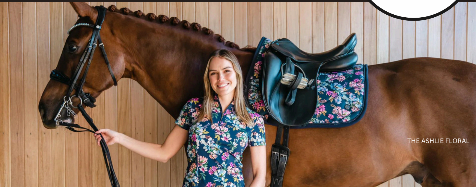
THE ASHLIE FLORAL